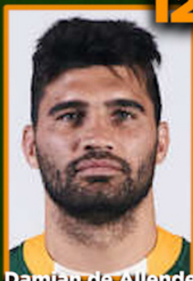
Damian de Allende