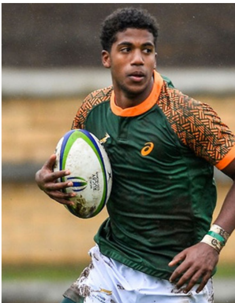
MOODIE PLAYING FOR THE JUNIOR BOKS

Bulls head coach Jake White believes that young star Canan Moodie has what it takes to play 100 Tests for the Springboks after the outside back was called up to the national squad for the first time.