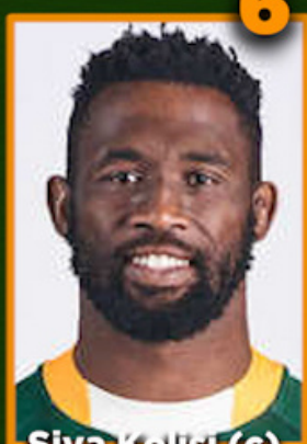
Siya Kolisi (c)