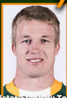
Pieter-Steph du Toit