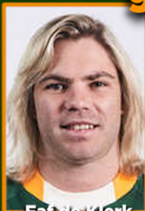
Faf de Klerk