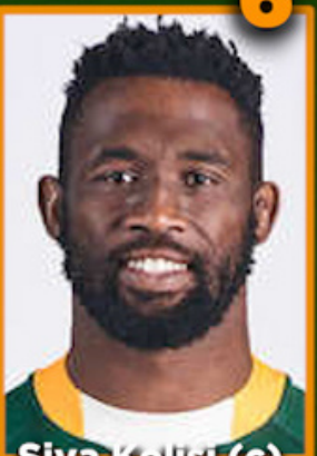
Siya Kolisi (c)