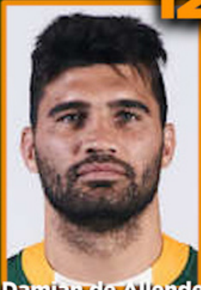
Damian de Allende