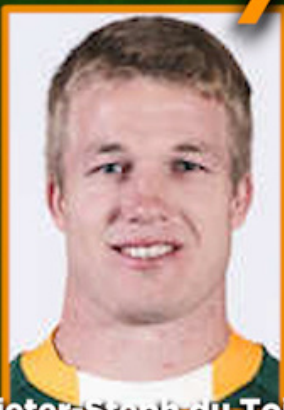
Pieter-Steph du Toit